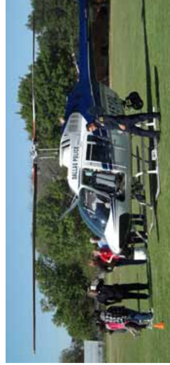
A special thanks to the Dallas Police Department for their participation in our first Fall Festival!

NON-PROFIT ORGANIZATION US POSTAGE PAID Dallas, Texas 75372 Permit #3540